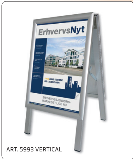
ART. 5993 VERTICAL

🇬🇧 Non-corrosive pavement board with anodized aluminum snap frames. 25 mm profile with corners cut in mitred. Back panels in galvanized steel. Front panels in anti reflex APET. Legs in 15 x 30 mm aluminum square tube. Weight: 2 kg.