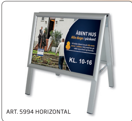
ART. 5994 HORIZONTAL